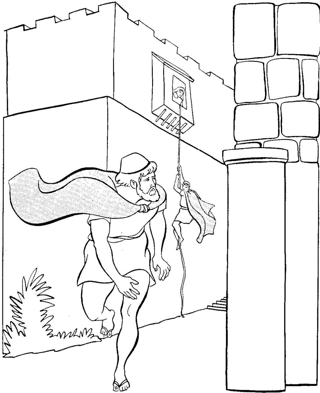
Joshua, the new leader of the Israelites, sent two men to spy on Jericho, the first city to be captured.